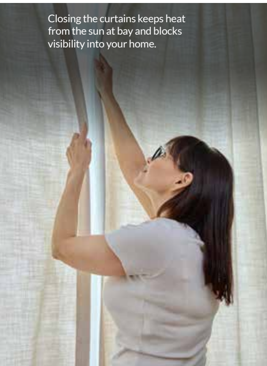
Closing the curtains keeps heat from the sun at bay and blocks visibility into your home.