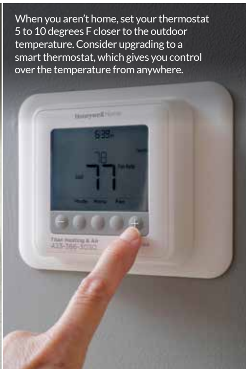
When you aren't home, set your thermostat 5 to 10 degrees F closer to the outdoor temperature. Consider upgrading to a smart thermostat, which gives you control over the temperature from anywhere.